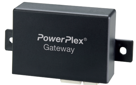
The PowerPlex® Gateway allows easy networking of a PowerPlex® system with another bus system.